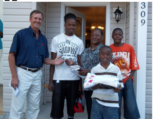
Ace Hardware Helps Bring a Family Home! Through the Community Contribution Tax Credit Program