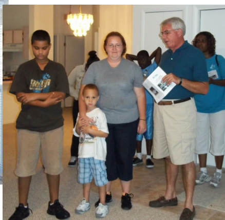
Partners and Donors Provide Guidance for Families! Through support and mentoring.