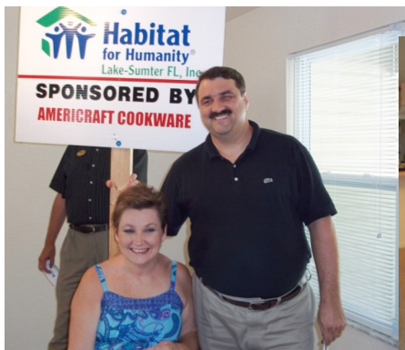
Americraft Cookware Makes a Dream - Reality! Through the Community Contribution Tax Credit Program